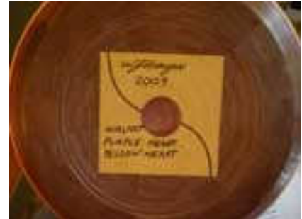
...with its amazing square bottom