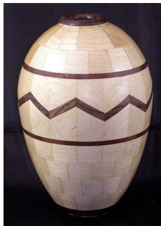
Ted's Piece from the Class

After five days I returned home not only with two halves of a rudimentary and leaky hollow vessel, which I completed later, but also with an appreciation for the vast range of segmented design possibilities and proper techniques to produce a variety of pieces.