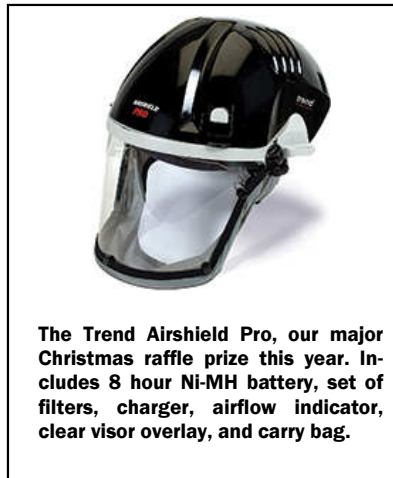
The Trend Airshield Pro, our major Christmas raffle prize this year. Includes 8 hour Ni-MH battery, set of filters, charger, airflow indicator, clear visor overlay, and carry bag.