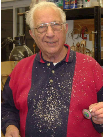
Dom the Chisler...